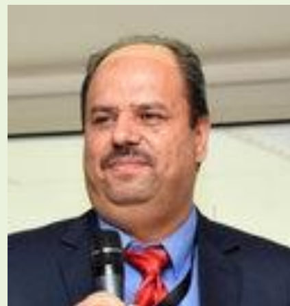
Professor of Applied Statistics